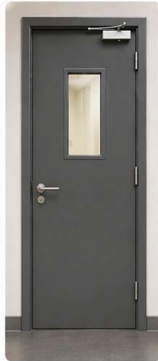
2. ACOUSTIC FIRE DOOR