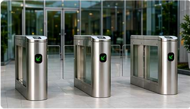
1. FLAP BARRIER