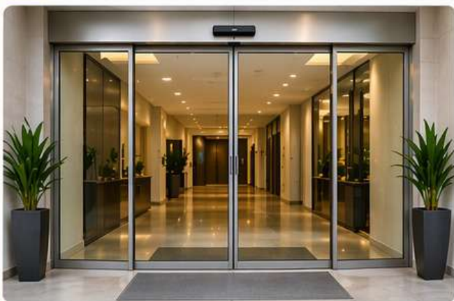
5. Automatic Sensor Glass Door