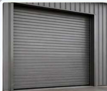
5. Mild Steel Rolling Shutter