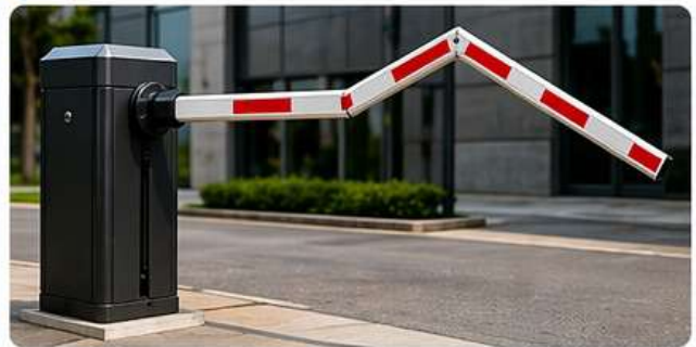
6. FOLDING BOOM BARRIER