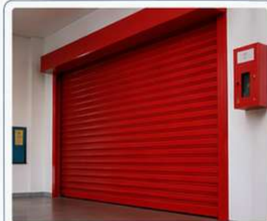
9. Fire-Related Rolling Shutter