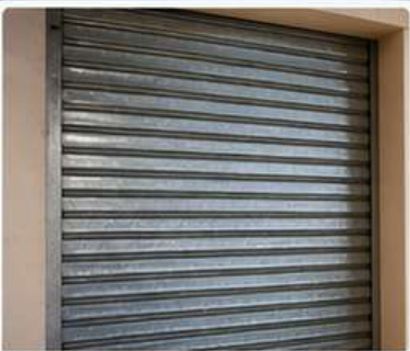
4. Galvanized Rolling Shutter