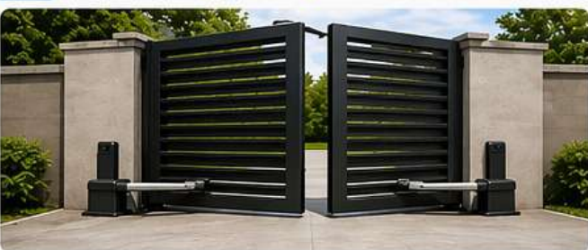
7. Bi Folding Swing Gate