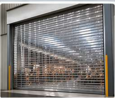
10. PVC Transparent Rolling Shutter