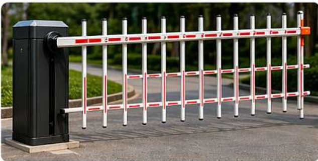
5. FENCE BOOM BARRIER