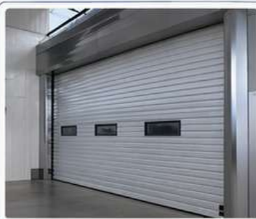
11. Aluminum Puff Insulated Rolling Shutter