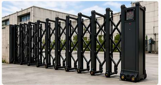
4. Retractable Sliding Gate