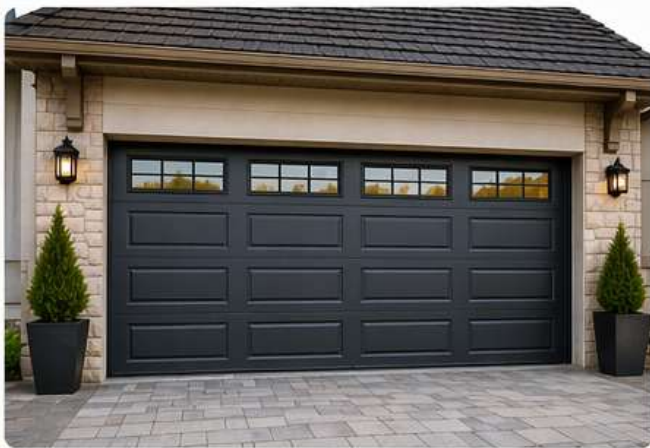
3. Overhead Garage Door