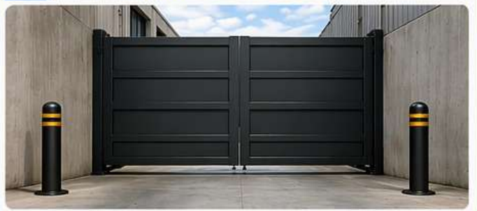
6. Crash Rated Gate