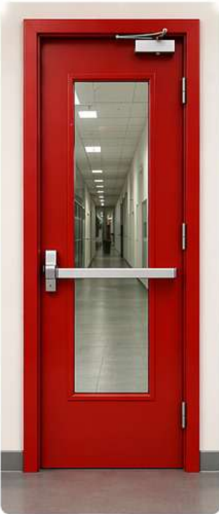
1. GLAZED FIRE DOOR