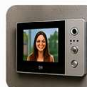
VIDEO DOOR PHONE