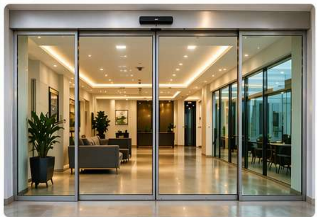
4. Transparent Glass Door