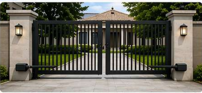
5. Swing Gate