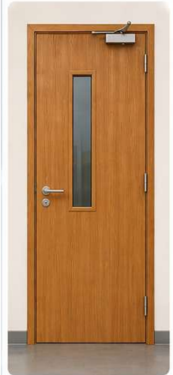
4. WOODEN FIRE DOOR