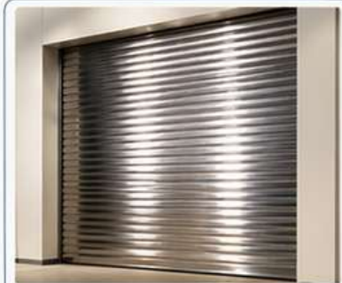
6. Stainless Steel Rolling Shutter