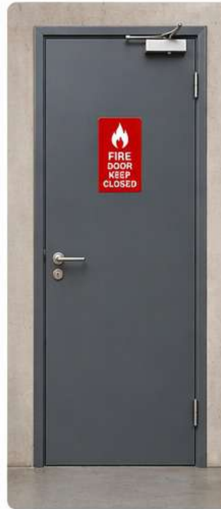
3. METAL FIRE DOOR