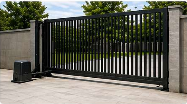
3. Cantilever Sliding Gate