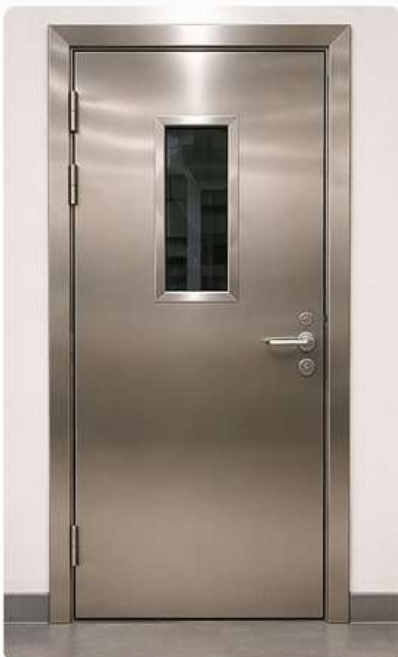
5. STAINLESS STEEL FIRE DOOR