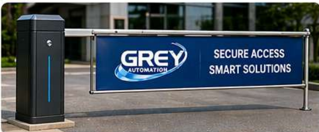
7. ADVERTISING BOOM BARRIER