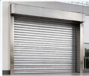
2. Aluminum Rolling Shutter