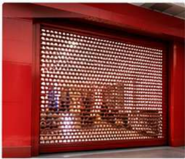
1. Perforated Rolling Shutter