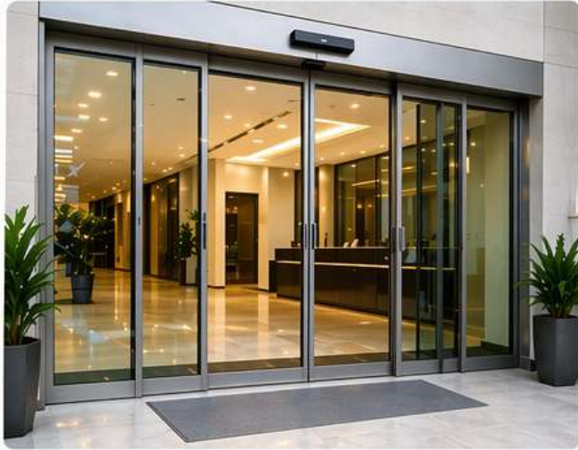
1. Telescopic Sensor Glass Door