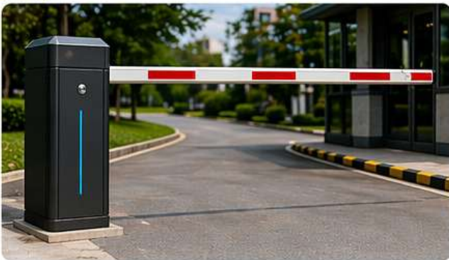
3. AUTOMATIC BOOM BARRIER