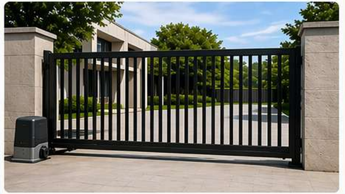
2. Sliding Gate