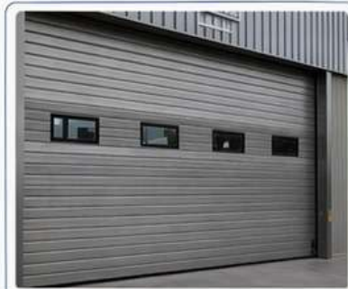
12. GI Puff Insulated Rolling Shutter