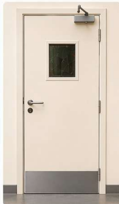
6. LEAD LINE DOOR