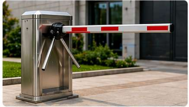
2. TURNSTILE BOOM BARRIER