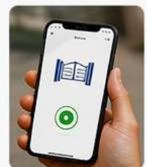
MOBILE APP CONTROL