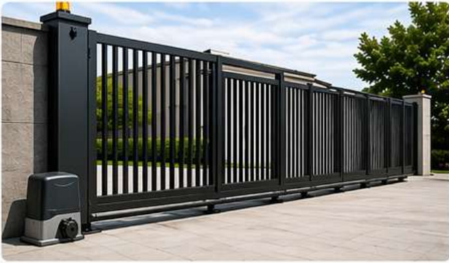
1. Telescopic Sliding Gate