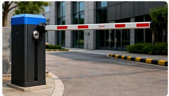
4. TELESCOPIC BOOM BARRIER