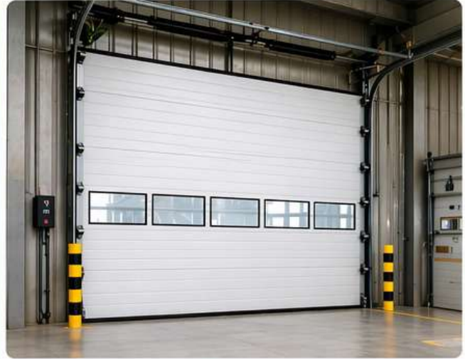
2. Overhead Sectional Door