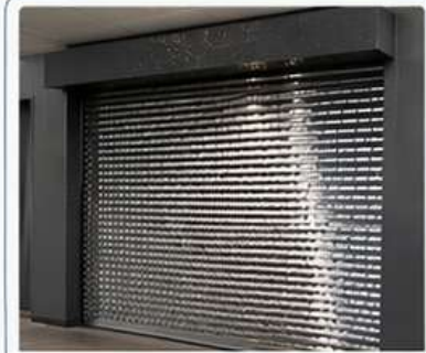
3. Galvalum Rolling Shutter